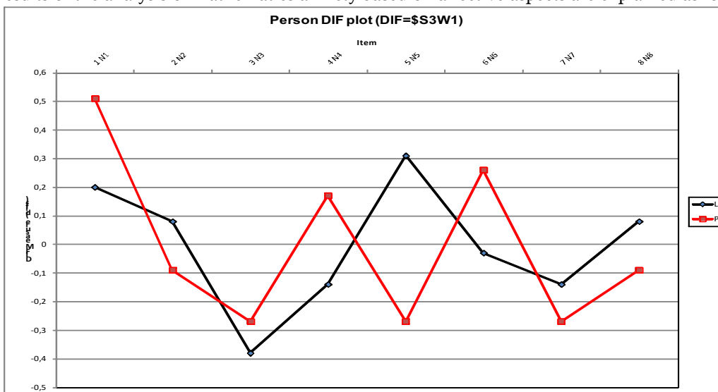
Figure 3. Mathematics Anxiety Based on Affective Aspects

The results of the analysis of mathematics anxiety based on affective aspects are explained as follows.