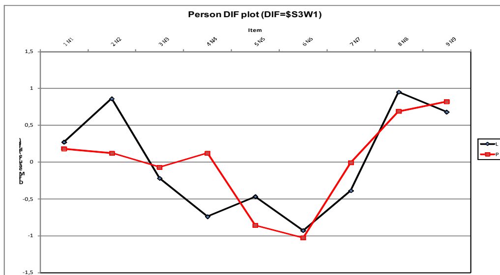
Figure 2. Kecemasan Mathematical Anxiety Based on Physiological Aspects

Figure 2 above shows the analysis of mathematical anxiety based on physiological aspects. From this picture, information can be obtained that the psychological symptoms of male students are higher than female students. The physiological symptoms shown by male students are in the form of increased heartbeat, the emergence of tension that is not conducive (Stoehr, 2017). Other symptoms that appear sweat that appear in the body when facing a count of nausea and stomach (Lyons & Beilock, 2012).